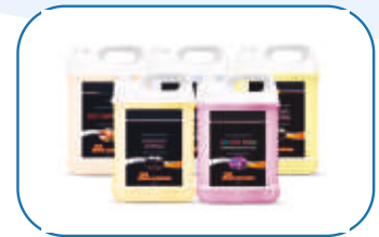
Washing & Polishing Chemicals

Stork equipments & Solutions are known for satisfactorily cater to the demands of customer base. Customer centricity is at the core and is this belief that has led the business to build long term relationship.