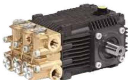
2310 - 5 HP-100 BAR-23 LPM