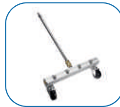
Under Body Lance