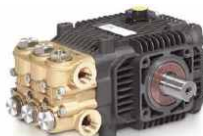
1218 - 3 HP-110 BAR / 5HP-180 BAR